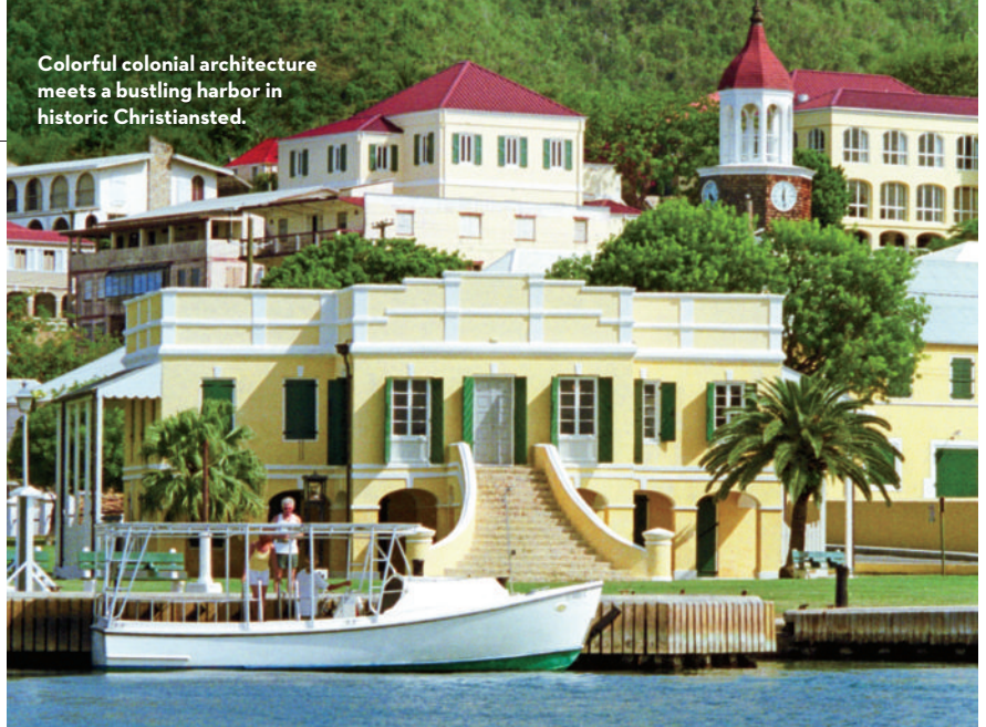
Colorful colonial architecture meets a bustling harbor in historic Christiansted.